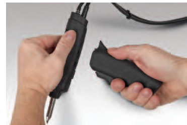
Remove grip for Pencil config.