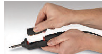
Collection chamber replacement