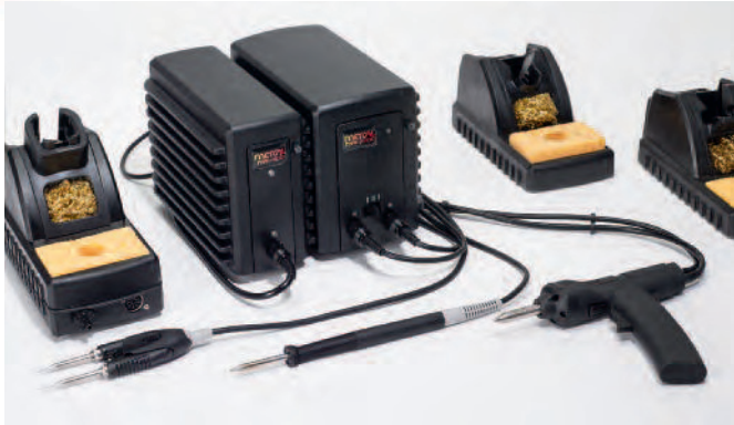
MFR-2200 and MFR-1100 series