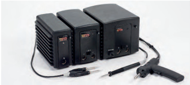
MFR-2200, MFR-1100 and MFR-1300 series (shown on page 14)